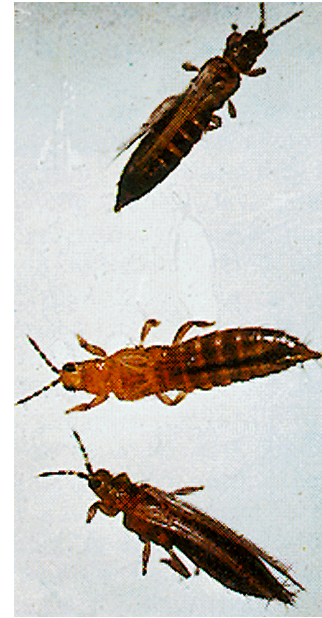
Western thrips adults

The most commonly used method of controlling thrips is the use of insecticides. Thrips populations can be monitored with yellow or blue sticky cards. The best method of preventing thrips infestations in greenhouses is to screen all vents and doors and avoid bringing infested plants into the house. Predators such as lacewings and minute pirate bugs are important late in the growing season, and may prevent thrips from increasing to larger populations. See the Pacific Insect Control Handbook for a list of registered insecticides and their use on different ornamental crops.