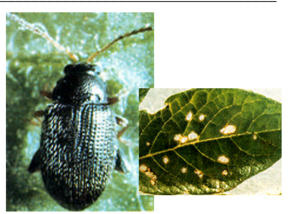
Flea beetle adult

Control of western potato flea beetle may not be necessary unless the population of adults exceeds 10 per 50 sweeps or unless the foliage shows severe feeding injury. For tuber flea beetle, treatment may be necessary when the adult population averages two or three per 7.6 m of row (25 ft). In June or July, five or six adults per 25 sweeps will cause economic loss. Treatment of the foliage with registered insecticides provides control of adult beetles. Application around the border of the field may be adequate to prevent