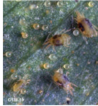
Twospotted Spider Mites

Adults range in size from 0.25 to 0.5 mm long and have eight legs (larvae have six). The twospotted spider mite is pale yellow or light green with two dark spots on either side of the dorsum. The twospotted spider mite is the most important species found on mint. McDaniel mites are translucent green to greenish-yellow with three spots on each side near the middle and two spots near the rear. European red mites are brick red to red-brown with white spots at the bases of the dorsal spines. Yellow mites are pale yellow or green with two or three pairs of small spots on the body.