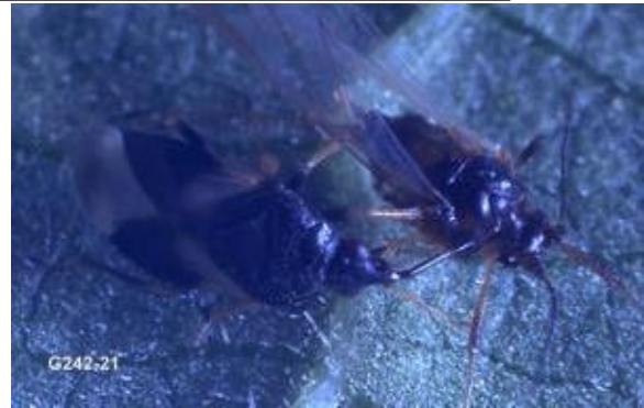
Minute pirate bug adult

Adults and nymphs are very active predators and may be found on all aerial parts of plants. Active stages feed by sucking the body fluids from aphids, spider mites, thrips, insect eggs, and immature stages of many small insects. They are particularly effective predators of thrips and spider mites. Adults and immature stages may consume more than 30 spider mites per day.