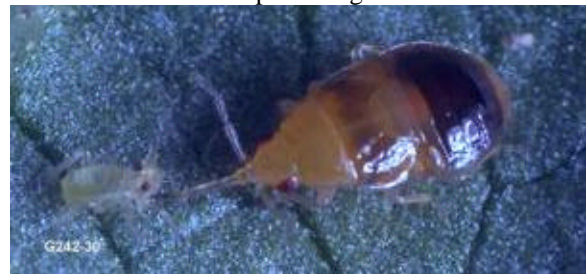
Minute pirate bug nymph