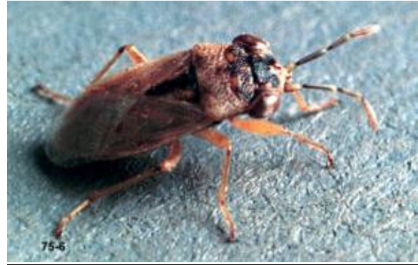
Bigeyed bug adult

Adults and nymphs feed by sucking the body fluids from their prey. Both are effective predators of lygus bug nymphs, aphids, leafhoppers, and spider mites, although smaller nymphs prefer to feed on aphids. Bigeyed bugs may play a major role in suppressing pest populations in several crops, particularly seed alfalfa, mint, and potatoes, if unnecessary applications of insecticides are avoided.