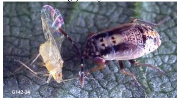
Bigeyed bug nymph