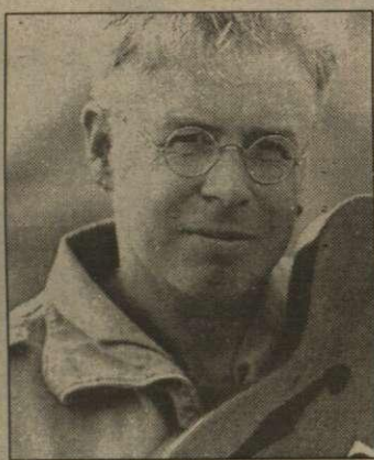
• Bruce Cockburn

Bruce Cockburn is making a return visit to Ireland after his