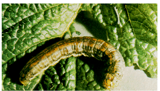
Redbacked cutworm larva

Control of redbacked cutworm and other Euxoa species is very difficult because of the subterranean habits of the larvae. Larvae are easiest to control when they are small and fields should be checked regularly to detect the presence of young larvae. The larval population can be estimated by taking soil samples around the bases of host plants or weeds in