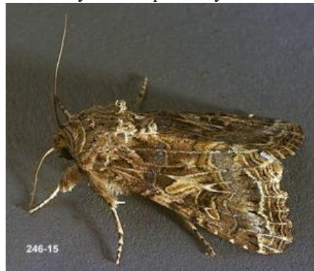
Western yellowstiped armyworm adult