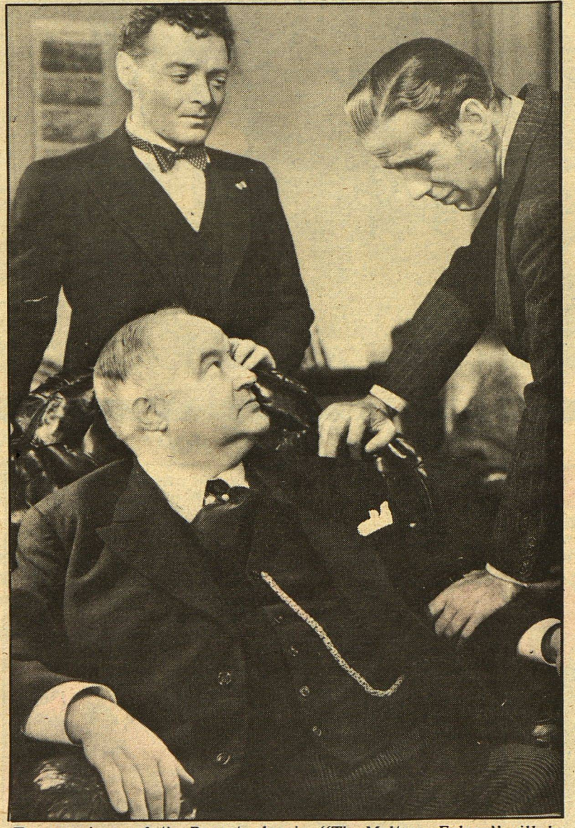
Two versions of the Bogart classic "The Maltese Falcon" will be shown at the Pacific Film Archives, Sunday.

FAIRS Wilderness Fair in Provo Park, Berk., 10 a.m.-6 p.m., free. 644-6520. Jambalaya Street Fair at Geary & Buchanan, S.F., 10 a.m.-6 p.m., free.