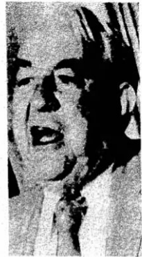
FORMER SEN. SAM ERVIN

Group Honors Ervin MIAMI (UPI) - Former Sen. Sam Ervin Jr., D-N.C., will receive the Herbert H. Lehman Award from the Jewish Theological Seminary of America.