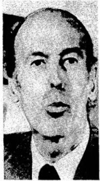
VALERY GISCARD D'ESTAING