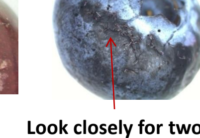
Look closely for two hair-like egg filaments sticking out of fruit

Fruits affected by SWD* Raspberries Blackberries